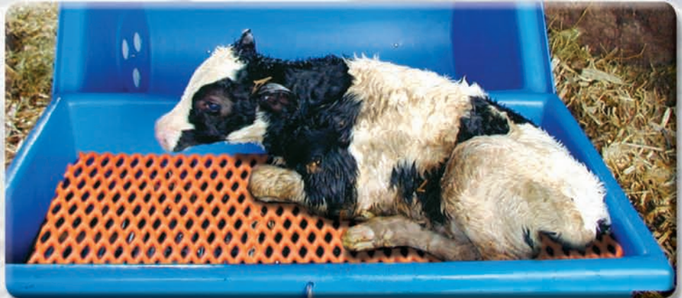
The PolyDome Calf Warmer provides a comfortable environment for newborn calves.

The PolyDome Calf Warmer provides a comfortable environment for newborn calves for the first few hours after birth. The top section is hinged, and removable, for calf entry. The floor is raised and slotted for easy heat circulation of the entire unit. There is a vent/peep hole on one end for proper ventilation and viewing the calf without opening the unit. The bottom is ribbed, and the front rounded, for easy transportation. The front is molded to accept an optional steel hitch for towing.