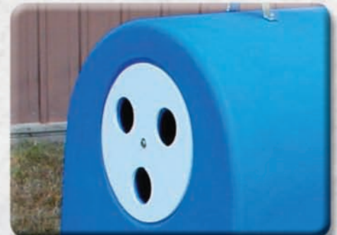
Vent/peep hole for proper ventilation and viewing